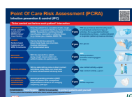
PCRA risk assessment